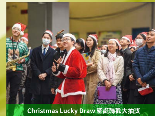
Christmas Lucky Draw 聖誕聯歡大抽獎