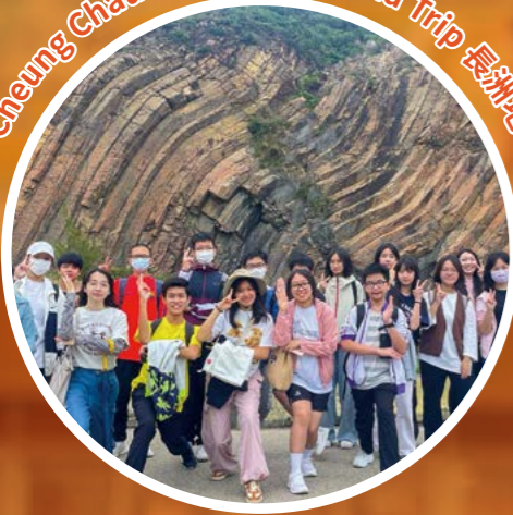
Cheung Chau Geography Field Trip 長洲地理考察團