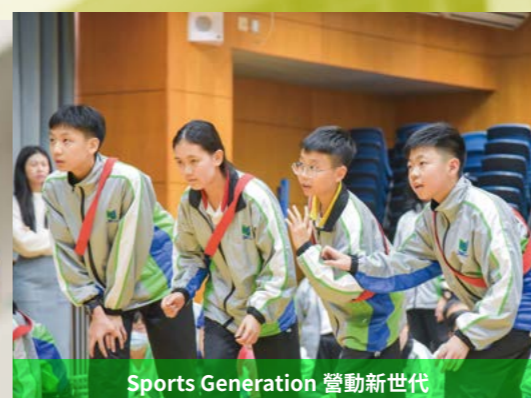
Sports Generation 營動新世代