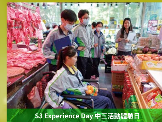
S3 Experience Day 中三活動體驗日