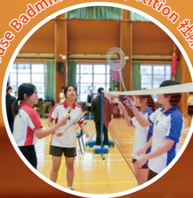
Inter-House Badminton Competition 社際羽毛球比賽