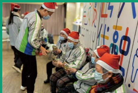
Christmas Volunteer Activity