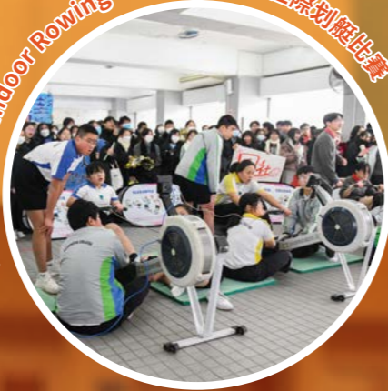
Inter-House Indoor Rowing Competition 社際划艇比賽