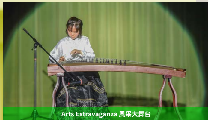
Arts Extravaganza 風采大舞台