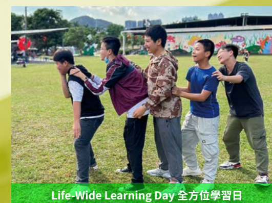
Life-Wide Learning Day 全方位學習日