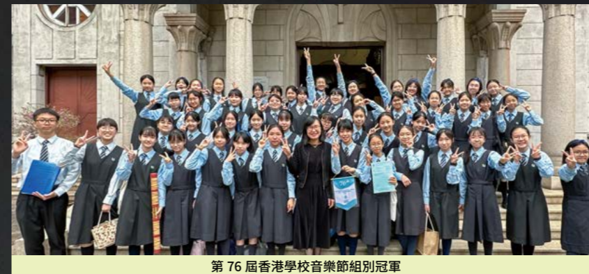
第 76 屆香港學校音樂節組別冠軍