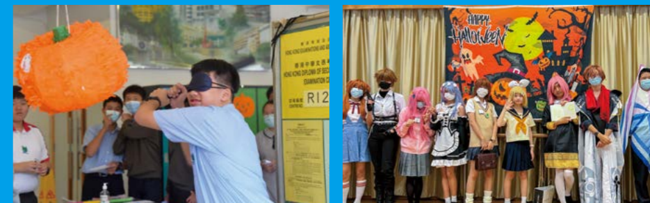
Halloween Fun Fair

A s per our promise, "You will have everything," we meant it – candies, games, presents, and even a dress-up competition. Halloween doesn't get any better than this, and all the happy faces prove it!