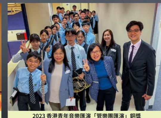
2023 香港青年音樂匯演「管樂團匯演」銅獎