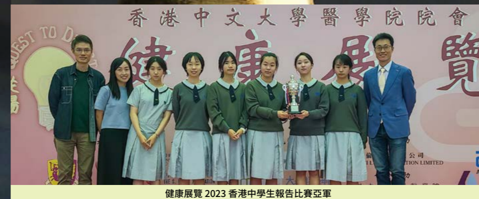
健康展覽 2023 香港中學生報告比賽亞軍