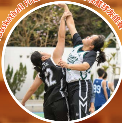
Inter-school Basketball Friendly Match 聯校籃球友誼賽