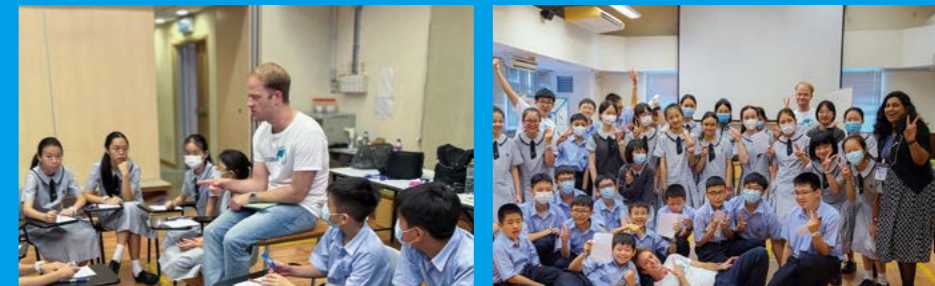
S1 Bridging Program

B ridging Program does far more than getting our brilliant newcomers ready for an exciting new chapter in their journey to learn; it helps them connect to each other, to the school, and to the world.