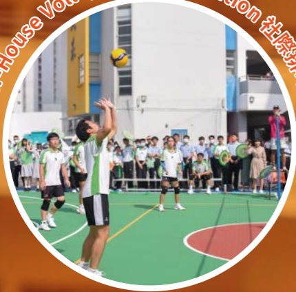
Inter-House Volleyball Competition 社際排球比賽