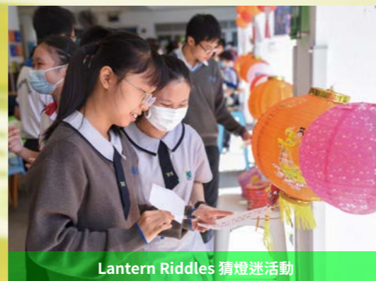
Lantern Riddles 猜燈謎活動

我們非常重視培養學生的身、心、靈健康。我們推動健康的生活模式，保持心理健康，培養健康的社交互動，以及建立有意義的人生價值觀。我們相信教育應該超越學術，涵蓋學生的整體成長，並為他們追求充實而平衡的生活提供裝備。通過各種課程和計劃，我們努力賦予學生能力，使他們能夠在課堂內外過上健康而有意義的生活。