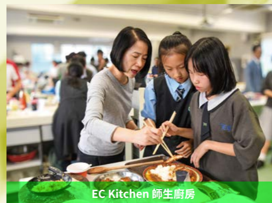
EC Kitchen 師生廚房