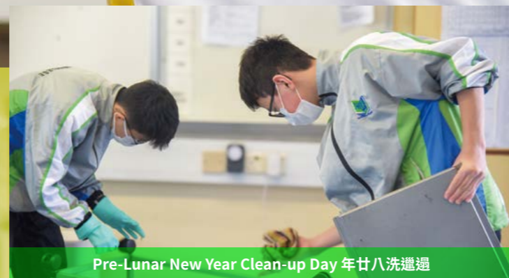
Pre-Lunar New Year Clean-up Day 年廿八洗邋邋