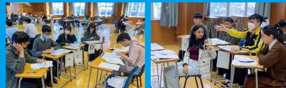
Joint-school Speaking Practice

U tter truth: Practice makes perfect, and it's especially true for speaking exam preparation. When caring teachers and diligent students from 3 schools join forces to engage in authentic discussions, success is all but guaranteed.