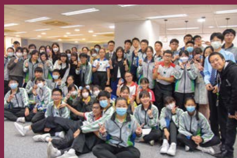
Inter-House Library Competition

Interesting and diversified reading activities guide students to explore various learning subject areas and explore life by reading. By cultivating students' interests and habits in reading, improving their reading strategies and skills, and equipping them with self-learning capabilities, the practice of "learning from reading" has become a unique culture in our school, with the library as the fount of all knowledge.