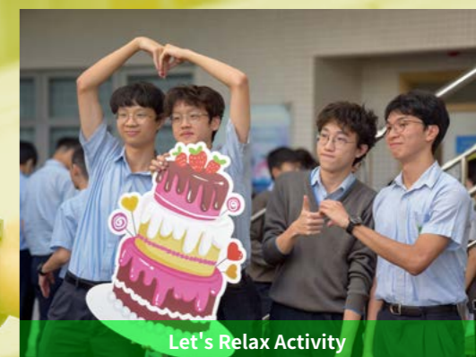
Let's Relax Activity